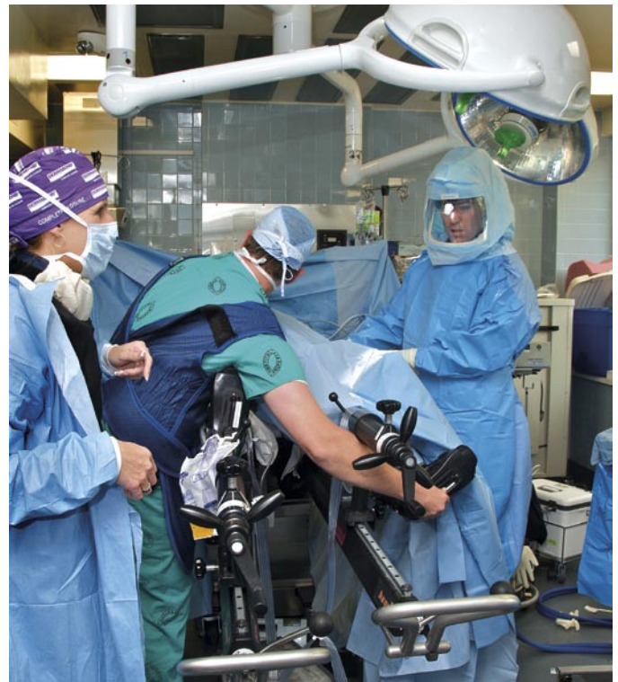
Assistant manipulating the leg during surgery