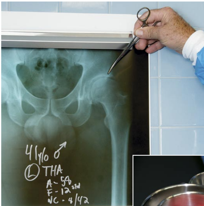
Pre-op X-ray showing fairly severe cam impingement-type arthritis in a young patient, becoming increasingly debilitated over several years